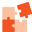
Knowledge & Understanding