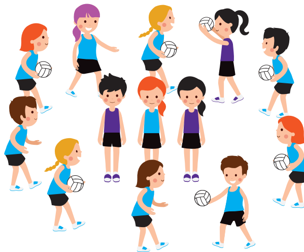
Anyone can participate & a wider talent base is created.

Muffin Break PDP provides more opportunities for more players to participate & develop.