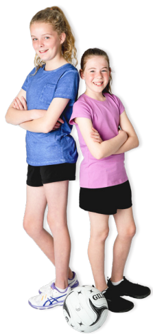
These players are both 12 years old.

As Netball is a late specialisation sport players grow & develop at different stages & ages.